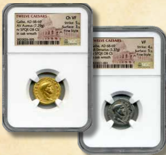
Silver denarius VF Fine Style with perfect surface.

The Year of the Four Emperors was actually a time lasting from early 68 AD to late 69 AD, and Galba was the first Emperor during this time of civil war. Although he had good intentions to restore state finances, the way he went about doing it enraged the populace and he was assassinated in 69 AD by the bribed Praetorian Guards at the request of Otho, who succeeded him. He was a man of great wealth and was unconnected by birth with any of the Caesars. He was prophesied as early as the time of Augustus to be a man of future eminence in the Empire. Only ruling for seven months, he issued many coins. You can find his silver denarii with little difficulty, but collectors know his bronze and gold examples are a prize.