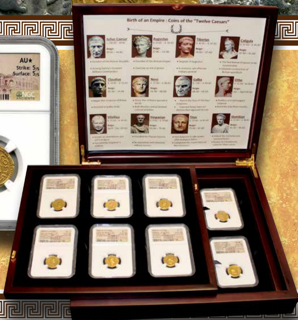
THE TWELVE CAESAR GOLD AUREUS SET

PURCHASE A COMPLETE SET, OR ONE COIN AT A TIME.