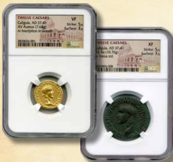
BRONZE As Graded XF with a perfect strike.