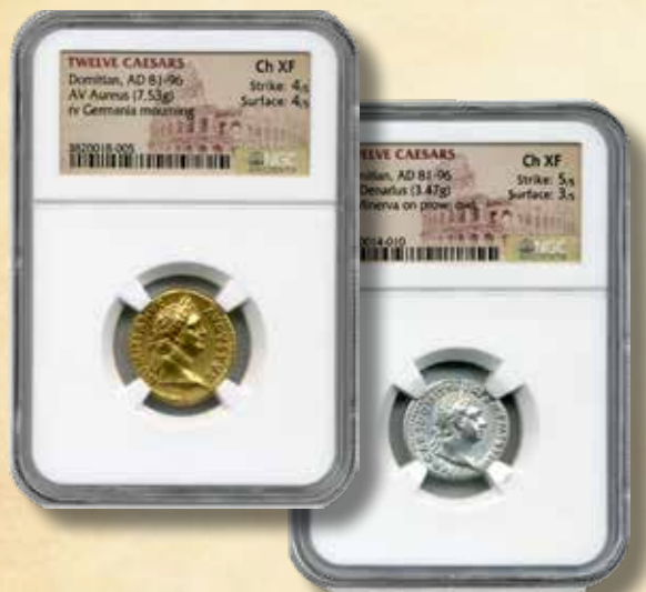
Silver denarius Graded Choice XF with perfect strike.

He restored the economy by revaluing Roman coinage, rebuilding the city of Rome, and fortifying the border defenses of the Empire. He felt immense envy towards his older brother, Titus, and had great desire to conquer Germany in an effort to achieve military fame, as in the end Titus had received all the glory for the successes in Judea. Domitian became deeply paranoid after learning of an astrological prediction about his death at "approximately noon", and would become extremely reclusive around this time each day. He is said to have had a dream just days before his assassination in which the goddess Minerva came to him and told him she could no longer protect him. Of all the Twelve Caesars coinages, those of Domitian are the most readily available. His silver denarii represents the best value; nice examples of his gold and copper coins are surprisingly hard to find.