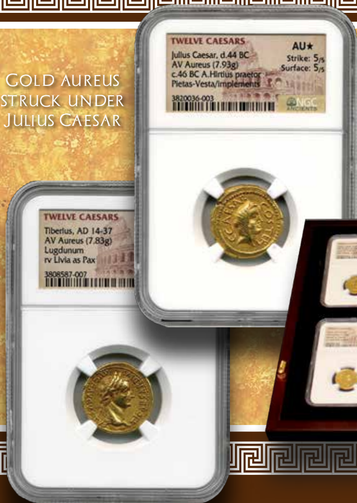
GOLD AUREUS OF TIBERIUS