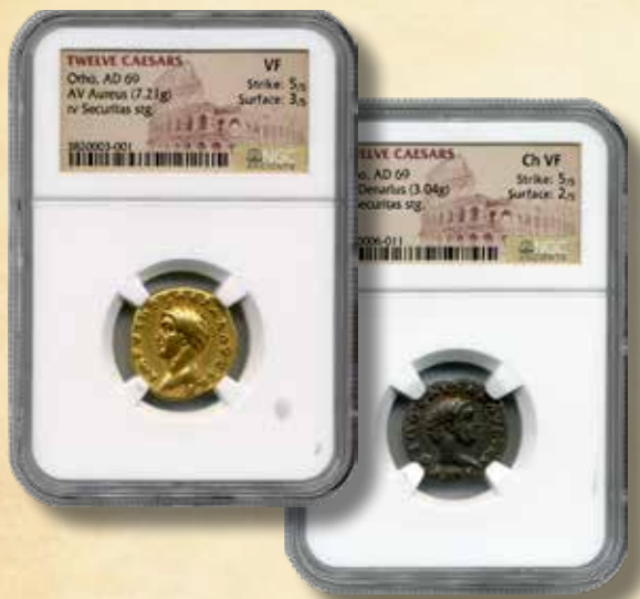
Silver denarius Choice VF with perfect strike.

Otho spoke these words to his army before retiring to his study the night before he committed suicide by stabbing himself with a dagger. This is a takeaway from other emperors who were too narcissistic to have done such a thing, caring about themselves more than their people. Otho is a complex figure that history has placed in a kinder light after his death. His initial rise to power was by capitalizing on Galba's refusal to honor his offer to pay the Praetorian Guards with gold, which led to Galba's assassination. As with Galba, the coinage of Otho presents a sincere challenge to the astute collector, and all coins issued in his name are in very high demand. This civil war emperor struck no Imperial bronzes, so collectors must be satisfied with either a silver denarius or a gold aureus. His denarii are quite scarce, and his aurei are extremely difficult to find. He served for just three months as the second emperor of the Year of the Four Emperors.