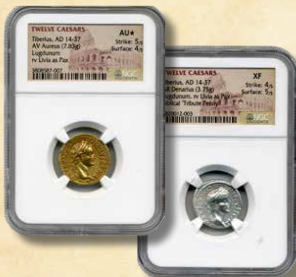
Silver denarius ‘Tribute Penny’ graded XF with phenomenal surfaces.

Gold aureus In a stunning AU★ with perfect strike.