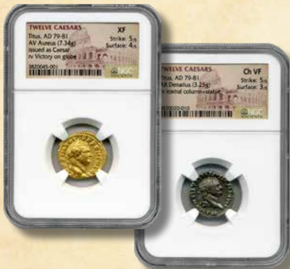
Silver denarius Graded Choice VF.

In 2007 a new list of the Seven Wonders of the World was created, adding the Colosseum in Rome to the list for the first time. Begun under his father, the Colosseum was completed under Titus. This landmark tells the story of the days of the gladiator and is frequented by millions of visitors annually. It is today one of the most iconic global landmarks and the grand symbol of ancient Rome. Titus was the son of Vespasian and was the first son of a 'Twelve Caesar' to rule. As the second emperor of the Flavian Dynasty, Titus gained immense notoriety as a military commander serving under his father in the First Jewish-Roman War. After ruling for just two short years, Titus fell ill and died ostensibly of natural causes. Despite his short reign as emperor, Titus struck many coins as Caesar under his father, which makes it possible to acquire a gold, silver, or copper coin of this good-natured emperor at a reasonable price.